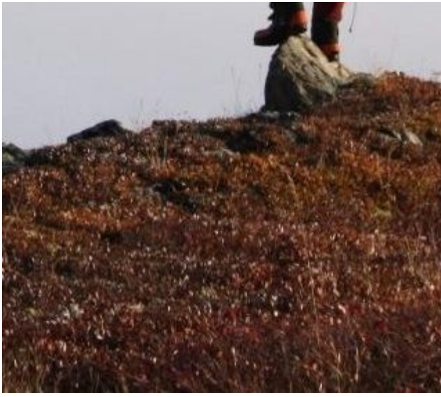
Heady stuff: Vertigo one of the most exciting discoveries of the year across the entire Yukon

All indicating that this acquisition was a very smart move for White Gold.