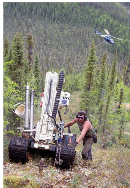
*Pending acquisition closing